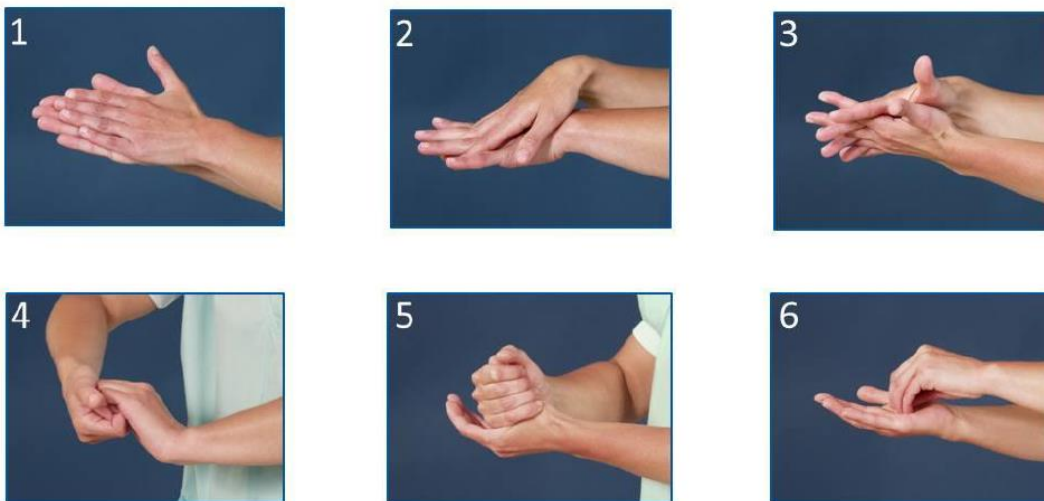
Figure 1: How to wash/disinfect hands correctly