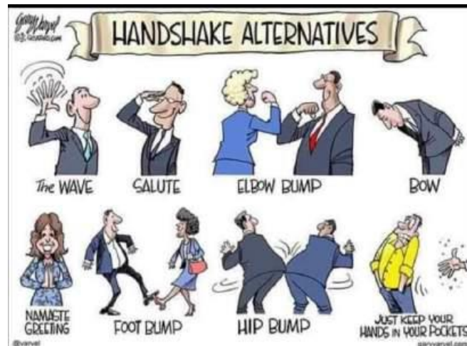
Figure 2: Suggested alternative handshakes

Social distancing is very important in the battle against this virus, therefore the measure of keeping a distance of at least 1.5 m is very important to maintain. This also applies to greetings that require close physical contact and therefore cause possible infection risks.